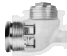
Drain elbow is another standard fitting with which DFT Basic-Check Units are used.

(1) 1/4", 3/8" and 1/2" BSS units have a 303 SS guard