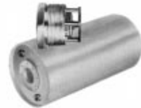
Two DFT Vacuum Breakers used in a “dry can”.

DFT® Vacuum Breakers provide effective protection against collapse of pressure vessels, tanks and rolls. They prevent condensate “back-up” when equipment is shut down or inlet steam is reduced by modulating control valves. In piping systems, DFT Vacuum Breakers are used to break siphons, prevent pipe collapse during transient pressure drops, and to provide addition of air on the downstream side of check valves to dampen water hammer.